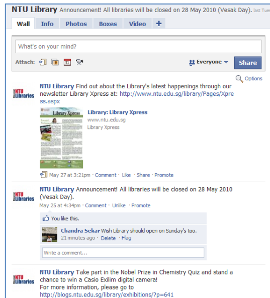
Figure 2: NTU Library Facebook Page URL: http://www.facebook.com/ntu.library

As of May 24 th , 2010, we have a total of 1,315 fans with over 80% in the 18-34 age groups. We have noticed a surge of activities when NTU Library organised major outreach events such as Freshmen Orientation and eResources Day. It was evident that the “viral marketing” characteristics of Facebook community helped to multiply our publicity efforts many folds. When a user becomes a fan (or likes) of our Facebook Page, all of his/her friends are informed. It is likewise, when librarians comment on someone else's status update, their network of friends view the comments too. One fun and engaging idea was inviting users to photo-tag the pictures which NTU Library had uploaded into Facebook.