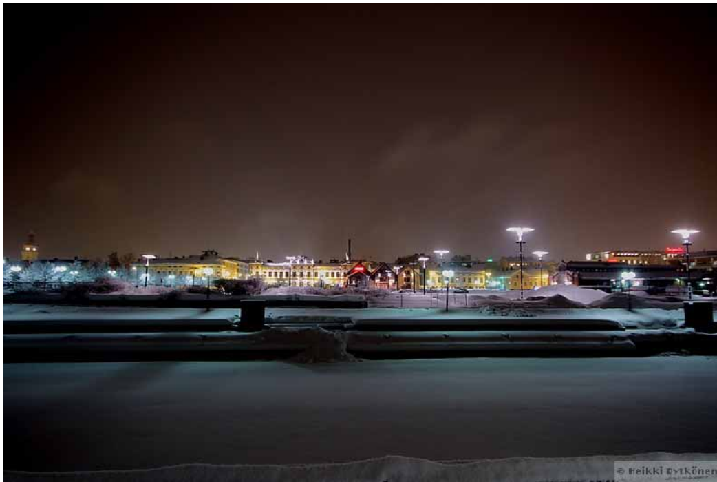
Kuva: Heikki Rytönen