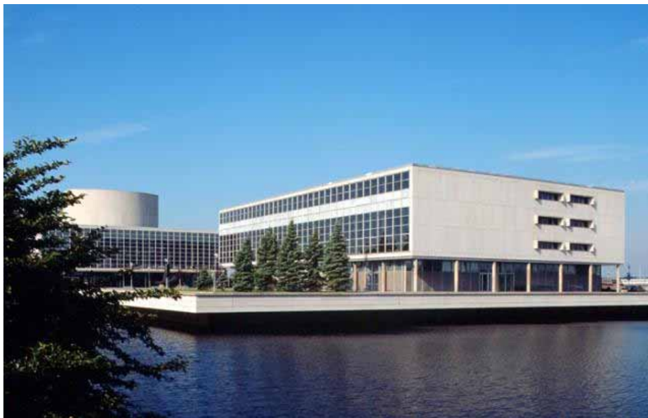
Kuva: Raimo Ahonen