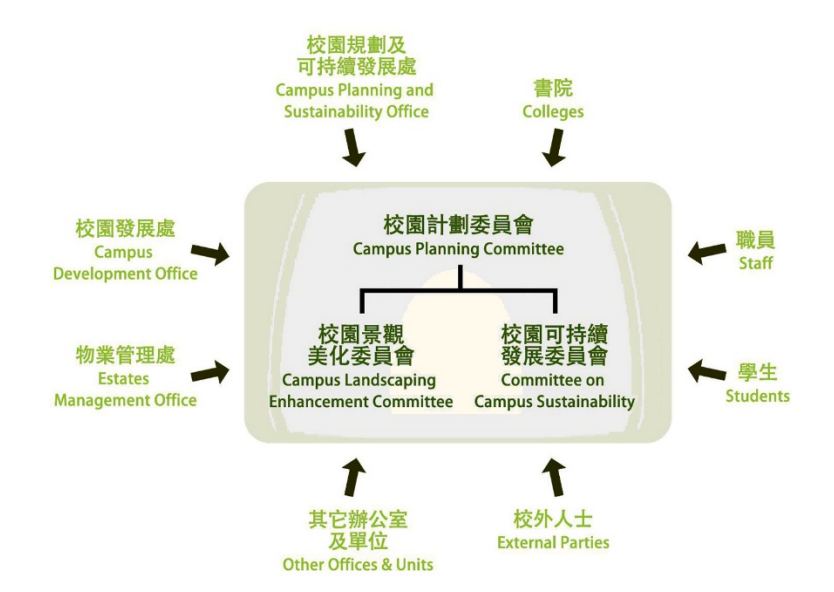
Fig. 1 CUHK's green governance framework http://www.cuhk.edu.hk/sustainability/en/our_work/strategic/governance.html

<u>Green Governance</u>. A Committee on Campus Sustainability formulates polices and guidelines for action plans, and oversees implementation (see Fig.1)