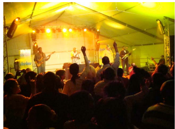
Beach party on Aug. 20