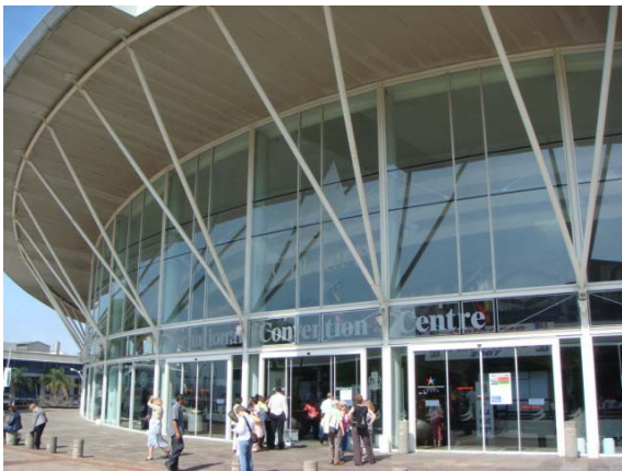
Conference venue: International Convention Centre Durban