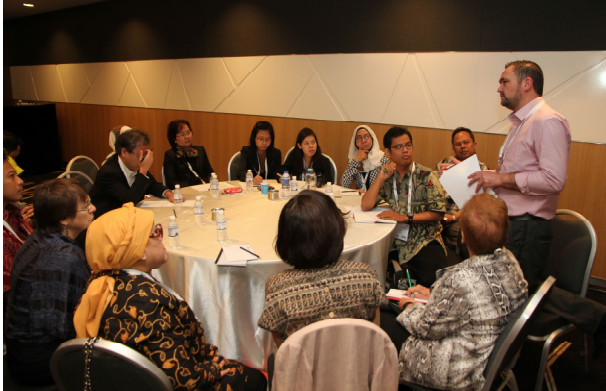
GLS Session at WLIC 2013 in progress

We had redesigned and printed our leaflet. It now includes current GLS standing committee members and a variety of new information about IFLA and GLS as well as pictures, etc. You can see the latest leaflet at this link: