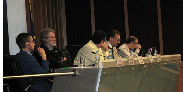
Working Sesión in progress

Different aspects were presented during the Working Session ranging from purely technical to systemic. The session began with two presentations about EBLIDA’s role and how this relates to government information and the role of public libraries in giving access to this kind of information. Some of the issues discussed were the data economy and how big, linked and open data have found their way in Greek public administration. Towards that end, a presentation of the ISA (Interoperability Solutions for European Public Administrations) programme took place which triggered the discussion about technical issues relating to interoperability, particularly semantic, and its benefits for the public sector.