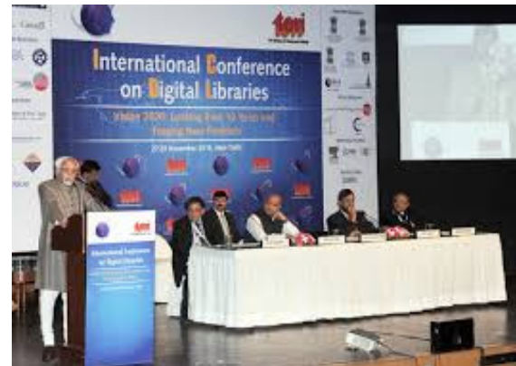
Hon'ble Vice President of India, Shri M Hamid Ansari delivering his inaugural address

The theme of the International Conference on Digital Libraries (ICDL) 2013, the fourth in ICDL series, was 'Vision 2020: Looking Back 10 Years and Forging New Frontiers'.