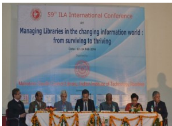
ILA inaugural session in progress

The 59th International Indian Library Association (ILA) Conference was organised by Mahatma Gandhi Central Library, IIT, Roorkee. More than 300 participants attended the conference where more than 60 papers were presented in 8 technical sessions.