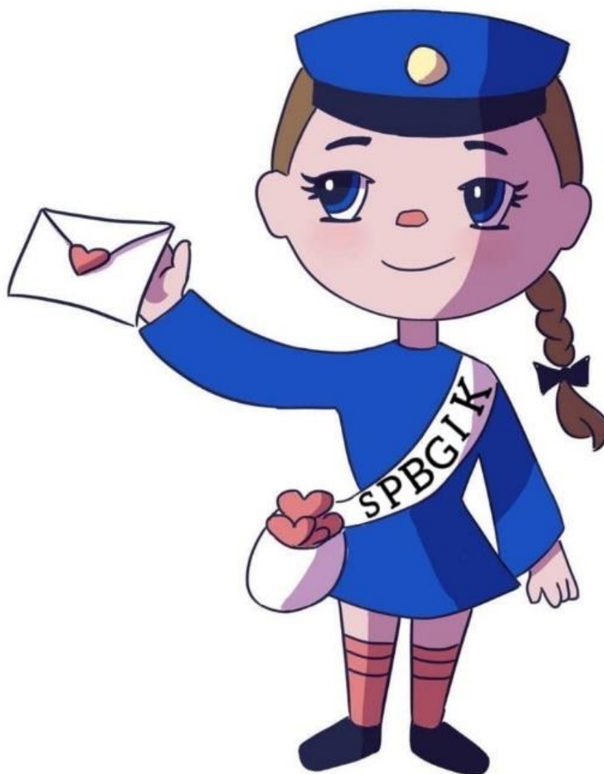
Logo of the LIS students-driven project "Postmen of goodness."