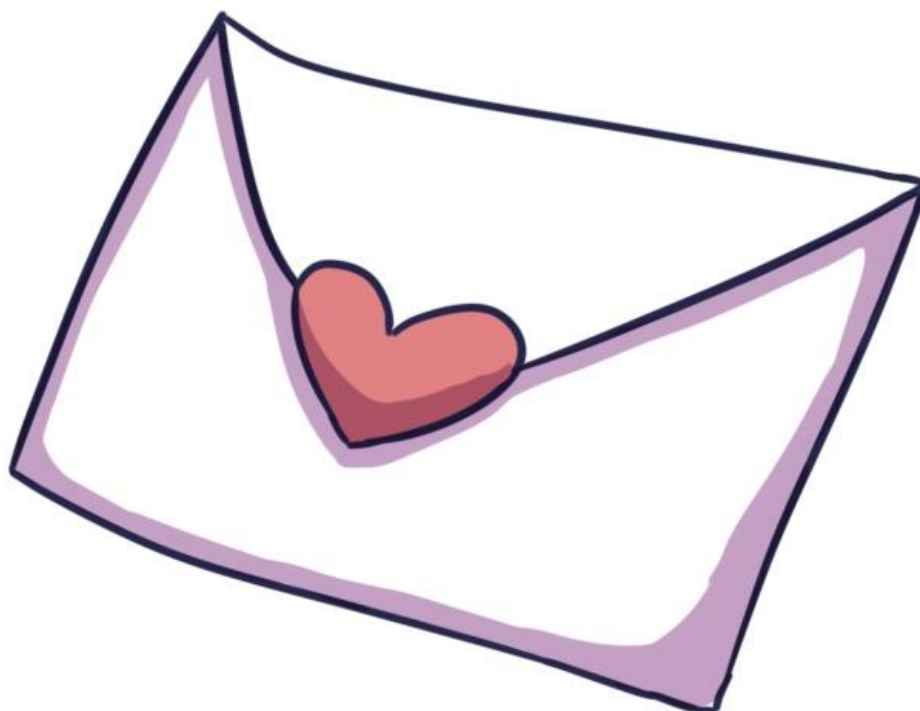
Logo of the LIS students-driven project "Postmen of goodness."