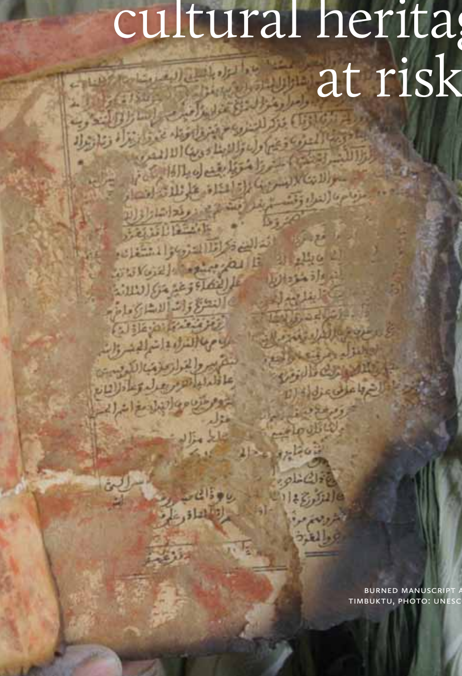
BURNED MANUSCRIPT AT IHERI AB, TIMBUKTU