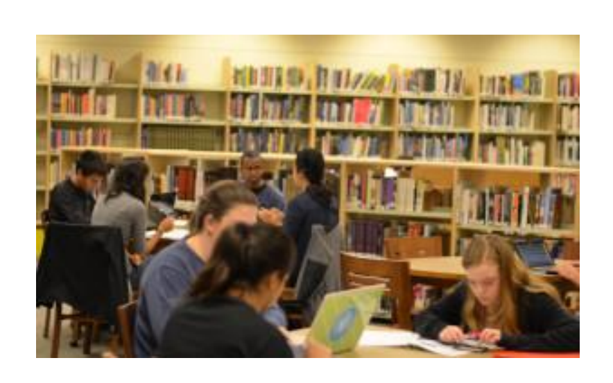
(Columbia Greene Community College Library)