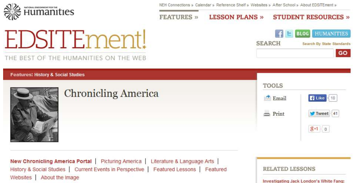
Figure 2 – Chronicling America Feature page on NEH’s EDSITEment! Website

America, Literature and Language Arts, History and Social Studies, Current Events in Perspective, Featured Lessons, and Featured Websites ( see figure 2 below ).