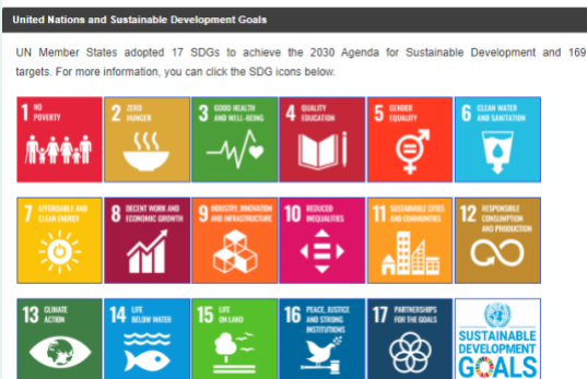
Image: Suna Kıraç Library Sustainable Development Goals Subject Guide

Our commitment to sustainability and the SDGs does not stop at a single guide. We have also enhanced our existing subject guides to align with the SDGs by adding relevant tags and icons. When users explore these guides, they can also see which goal each guide serves and how it contributes to one or more of the 17 objectives.