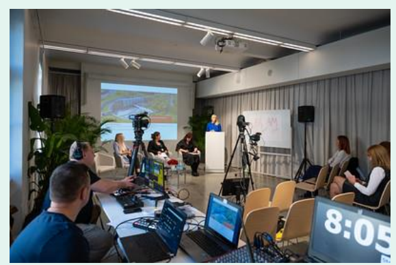
The process of the conference.

providing museum and library staff with various educational tools, to foster the understanding of the SDGs among cultural sector professionals. The promotion of transnational, cross-sectoral cooperation is also an important part of this initiative.