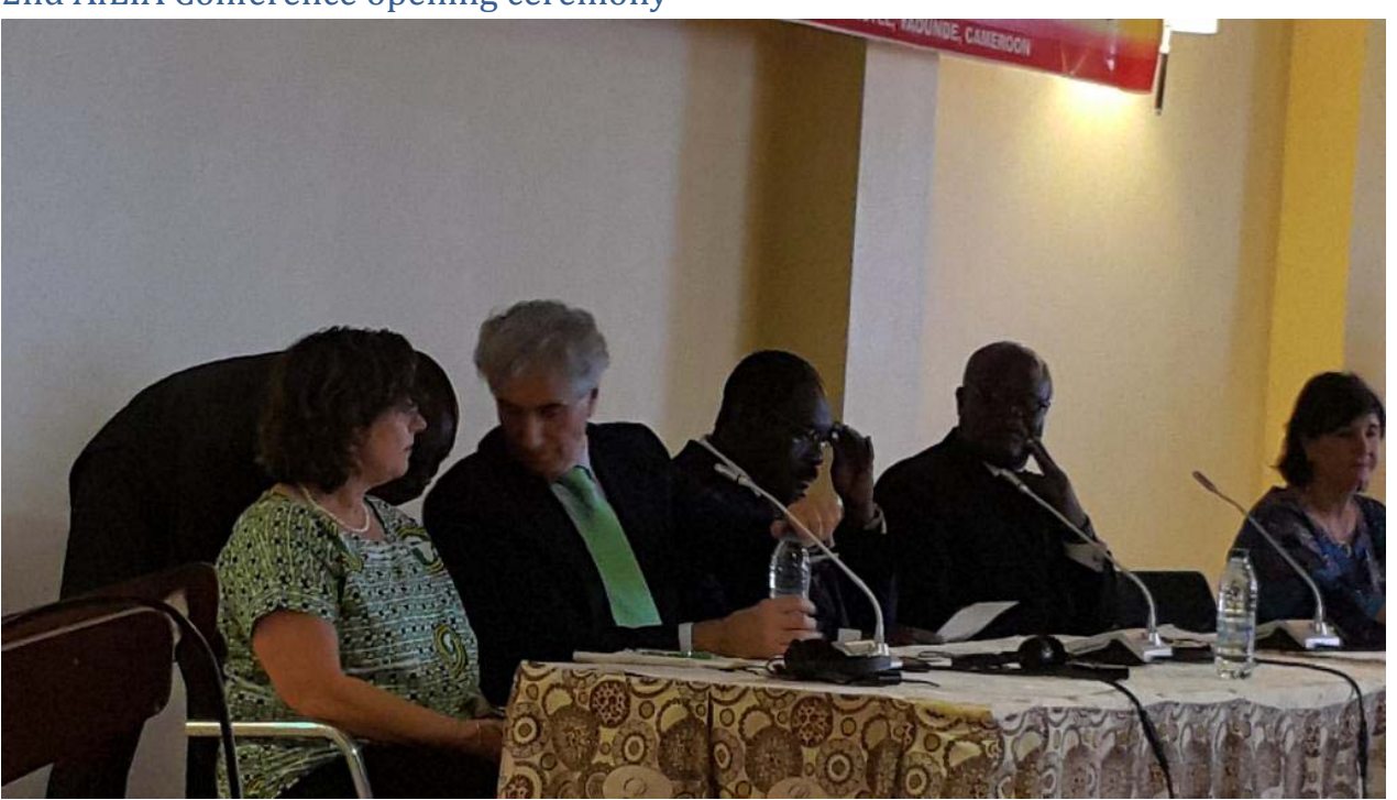
2nd AfLIA Conference opening ceremony