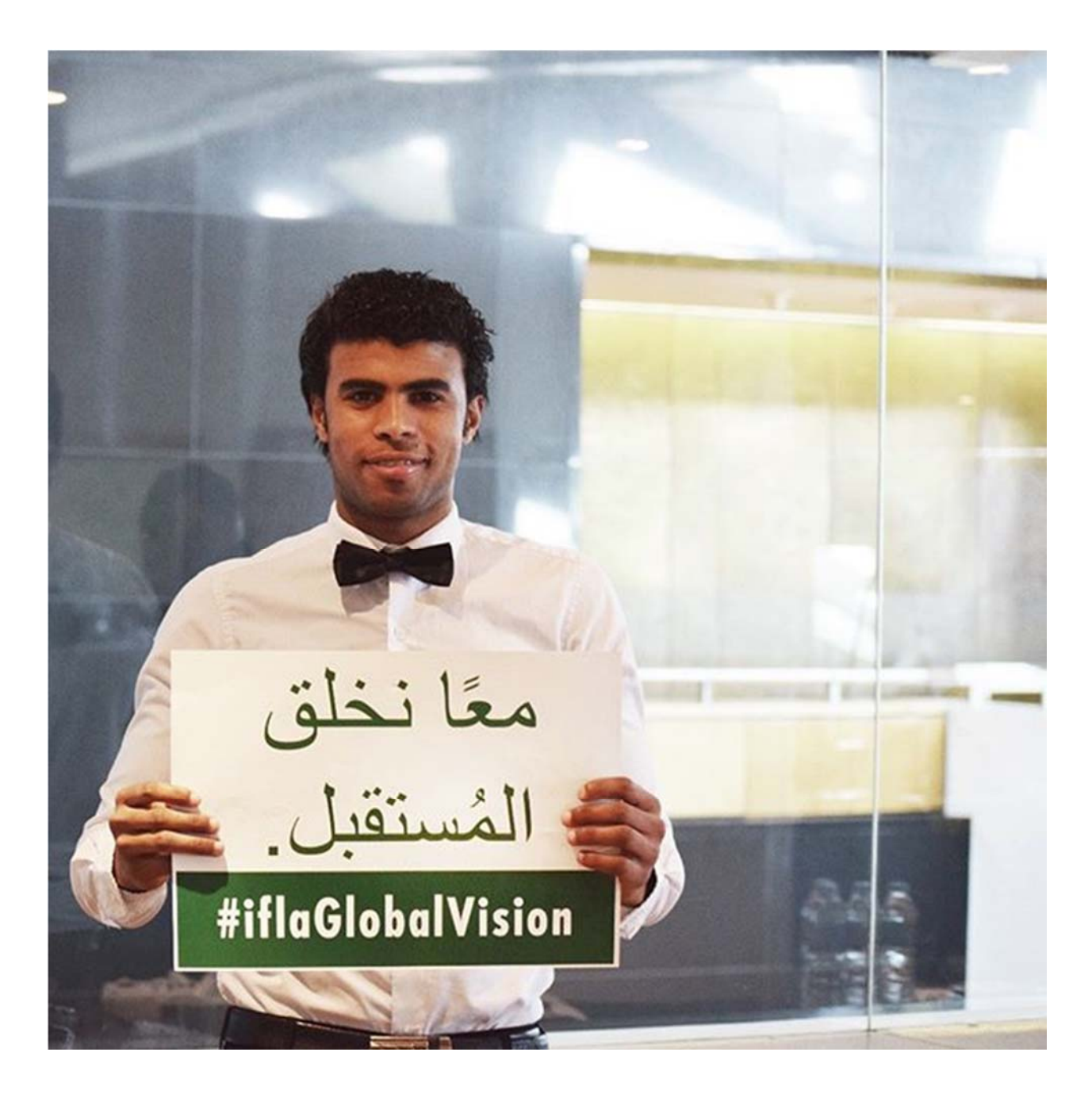
Global Vision Regional Workshop Egypt (for the Middle East and North Africa [MENA] region)