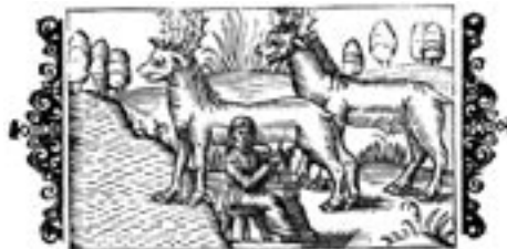
Reindeer milking, source Olaus Magnus Gothus, Historia de gentibus septentrionalibus . Romae 1555.

Building a cultural window in the entire Barents area is being continued through "the eLibrary & Culture without Borders" project 2006–2007. (The Barents Euro-Arctic Region, includes the northernmost parts of Sweden, Norway, Finland and Northwest Russia). In "eLibrary&Culture without Borders" project, cultural partition is being developed by creating the Barents Culture Window. It is a database-supported service portal which offers information for users in the cultural field as well as content whose producers can be in addition