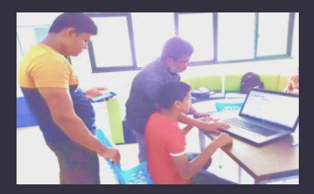
Skills Online Sri Lanka – Employed for the Unemployed

Greening the National University of Singapore's Central Librarv