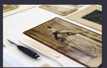
Treasured Voices at the National Library of Australia