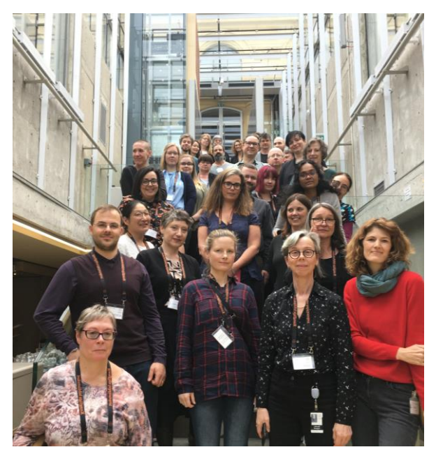
EDUG 2019