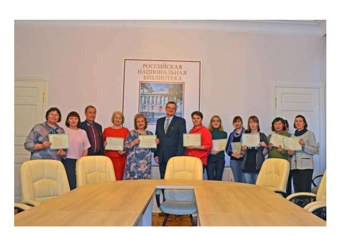
Workshop students on machine readable cataloging in RUSMARK format with advanced training diplomas

Communication on these issues has traditionally been carried out in the form of various "activities," including conferences (both offline and online — for example, webinars) and organizing and conducting educational programs in the field of additional education. The seminar on machine-readable cataloging in the RUSMARC format, organized by the Processing and Catalogs Department of the National Library of Russia, which has been successfully held at the NLR Training Center for several years already, is a real example of the successful application of these "activities."