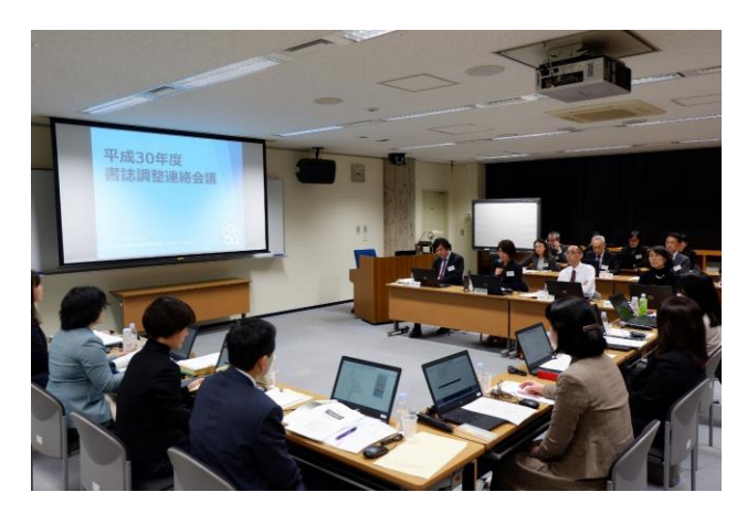
Annual Conference on Bibliographic Control

2021, the NDL plans to implement its own newly developed library cataloguing system.