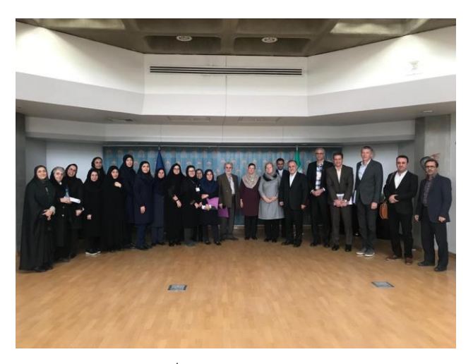
Attendees of the 5<sup>th</sup> UNIMARC Users' Group and 1<sup>st</sup> Middle East Regional UNIMARC Users' Group meetings, November 2018

On the 16<sup>th</sup> and 17<sup>th</sup> of November 2018, when the 4<sup>th</sup> National Congress of Information Science Professionals was underway in Tehran, the National Library and Archives of Iran (NLAI) hosted the 5<sup>th</sup> UNIMARC Users' Group and 1<sup>st</sup> Middle East Regional UNIMARC Users' Group meetings.