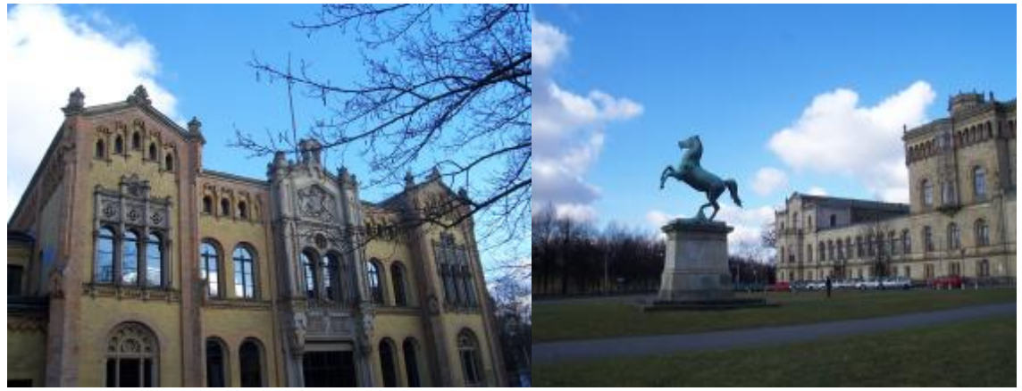
Scenes from Hannover reflecting the various architectural styles of the University, a church, and other buildings.