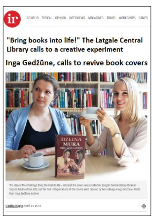
Publication on IR - Latvian National Magazine