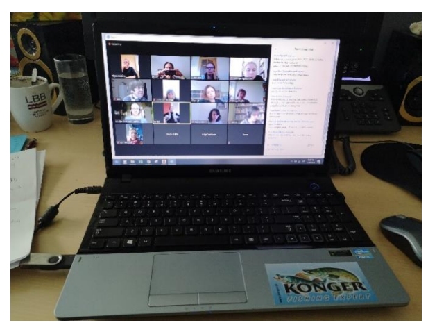
Webinar - online seminar during the Library Week in Latvia