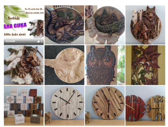
Virtual exhibition of Staicele Library

As the joy of travel is denied to people due to an emergency situation, the Central Library of Dobele Region offered a virtual exhibition "With a Book Around the World", offering books on travel matters and ordering them remotely. Many libraries offered virtual art and drawing exhibitions in collaboration with artists and drawing authors.