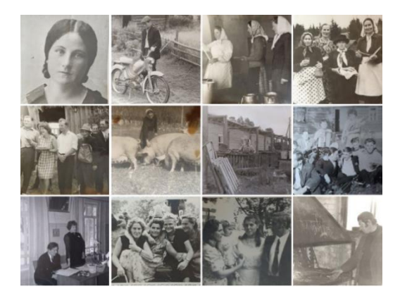
Library history and local history: Cibla Library photo gallery from community shared personal pictures

The fact that libraries actively collect local history materials from the population: photographs, memory stories, etc., is nothing new. And it was logically that Library Week was used to actively ask the population to get involved and to share with various materials for the aim of local history work.