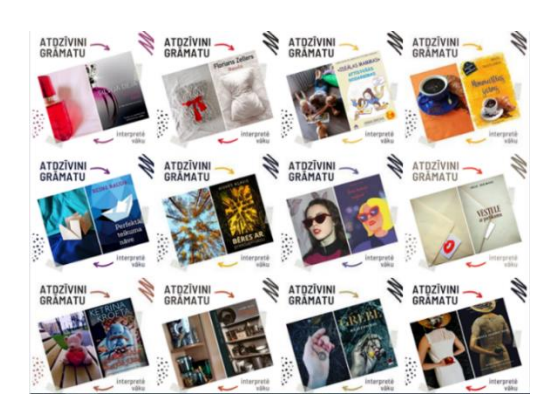
"Revive the book – interpret the cover, an activity of the Latgale Central Library