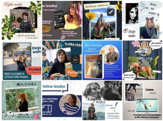
Valmiera Library activity - The Librarian Recommends