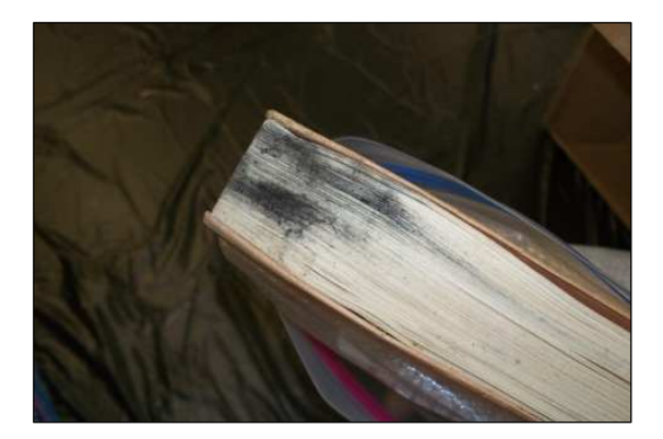
Close-up of active mold