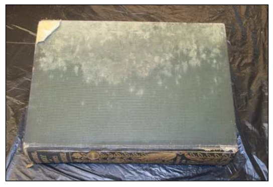
Mold growth in cover of book

It was discovered that a few boxes of books from the collection were damaged by sewerage overflow; the boxes were then taken to NALIS to be fumigated. An analysis of the eight boxes revealed that at least thirty (30) books were infected with active mold. Many of these books have Capildeo's signature or an ink stamp. These books have since been isolated and placed in cold storage. The books not requiring urgent treatment have been sent for inventory and sanitization.