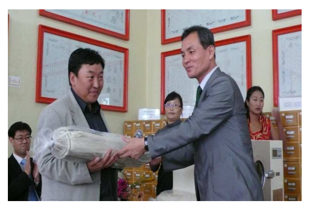
[Donation of preservation materials]