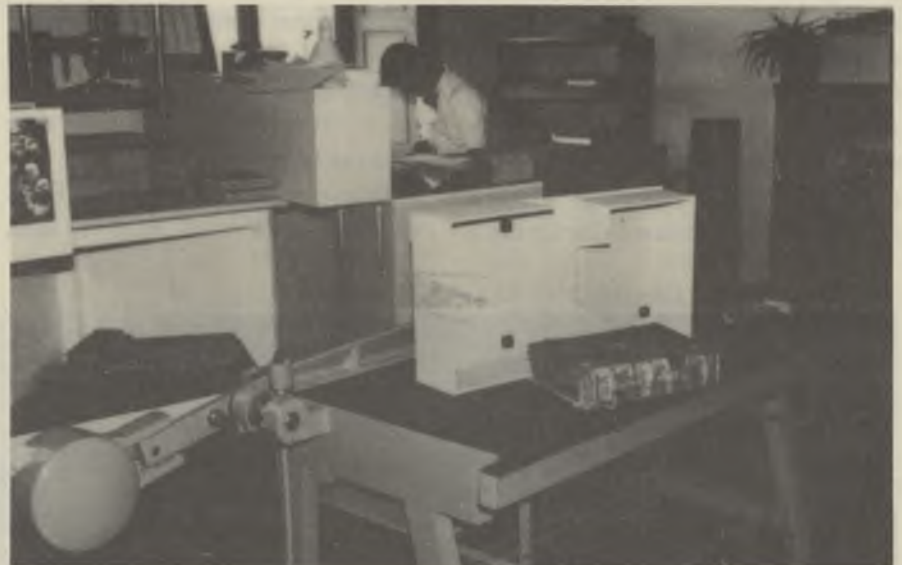
Book Restoration Department, Conservation Center, Bibliothèque Nationale, Sablé.

The Conservation Center of the Bibliothèque Nationale is located in the Castle of Sablé in Sablé, a small town of 12,000 inhabitants situated 250 kilometers southwest of Paris. The Conservation Center is responsible for the safe-keeping of the