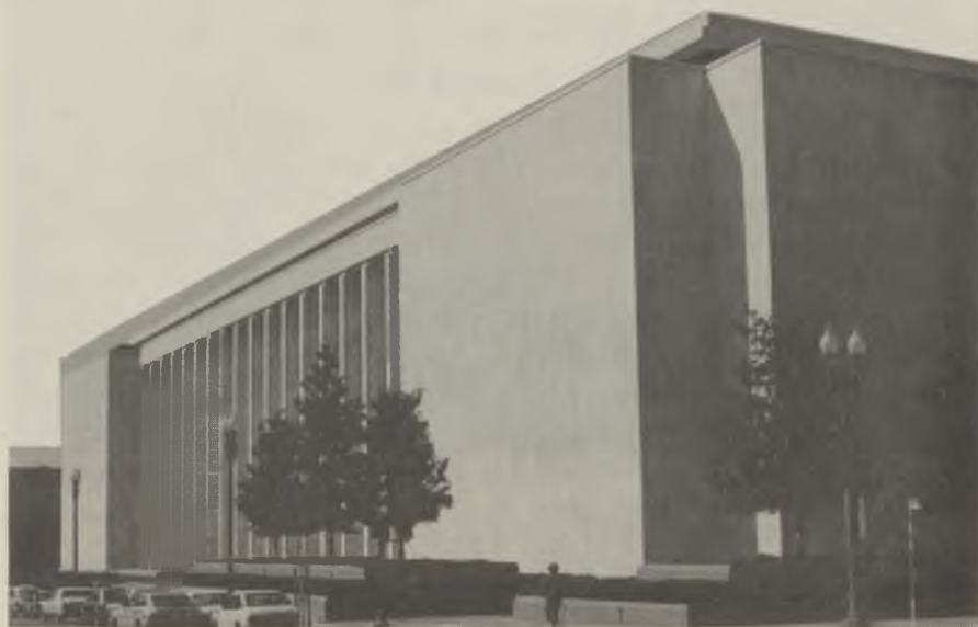
James Madison Building, Library of Congress, location of the PAC international focal point.