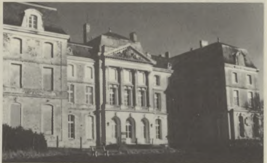
The Castle of Sablé, Sablé, France, is the home of the Conservation Center of the Bibliothèque Nationale and the PAC Regional Center.