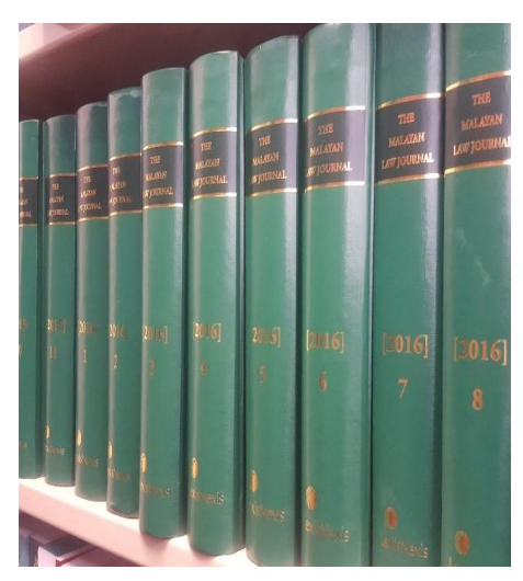
Collection of Malayan Law Journal