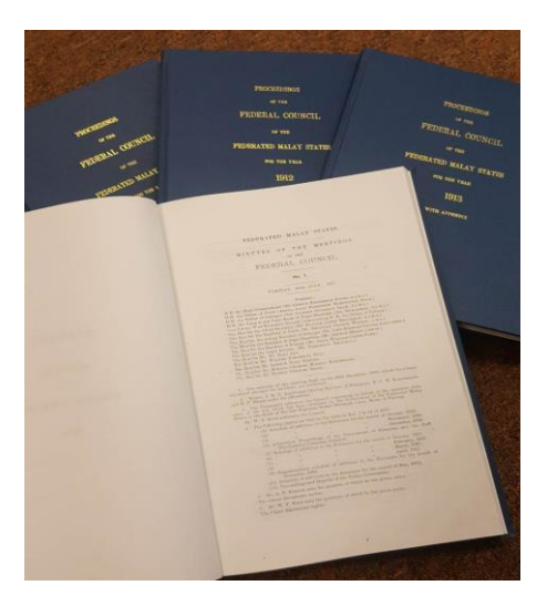
Proceedings of The Federal Council of The Federated Malay States