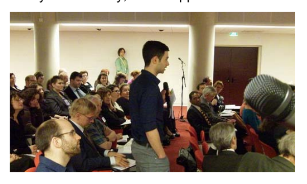
LIS students from Europe taking part in substantial discussion on freedom of access to information.

discussed in the European and/or US setting, the lessons learned are applicable to all libraries in all regions of the world. The situation facing libraries today and the response policies developed by European library institutions and IFLA that the speakers and the attendees shared with me definitely motivated me to become more of an advocate in my own country, the Philippines.