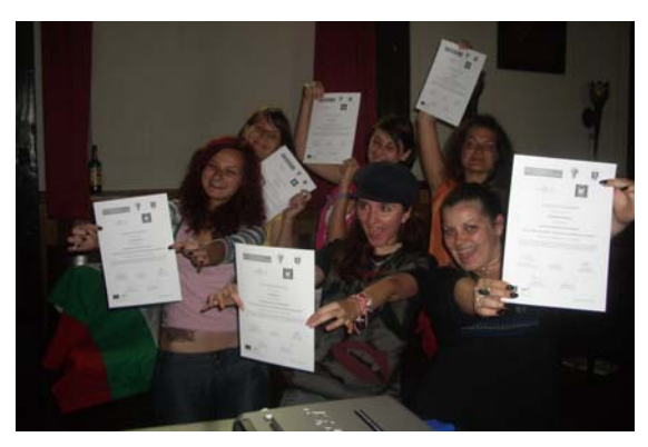
Proud of certificates for successful participation!

Traditional vs. E-newspapers and Ethics in journalism. During the ISSS the teachers will present the main topic and all students together will discuss different aspects of newspapers. The students of each country suggest two subjects for these discussions. At the end of the school each workshop presents the results of debates and the students receive a certificate for successful participation in the ISSS.