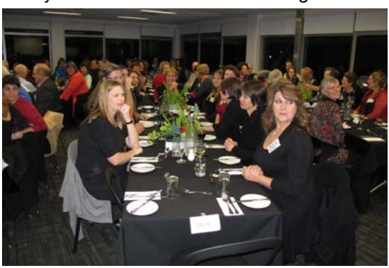
The dinner, organised by the the Information Studies Alumni Committee.

The program has developed and evolved since its inception in 1971 and remains one of the largest graduate programs at Curtin. It covers the discipline areas of librarianship, records management and archives. It has evolved in times of calm and strife, including the advent of the Internet, and the climate of library school closures that this brought with it.